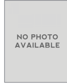
Kirk Handrup Aurora